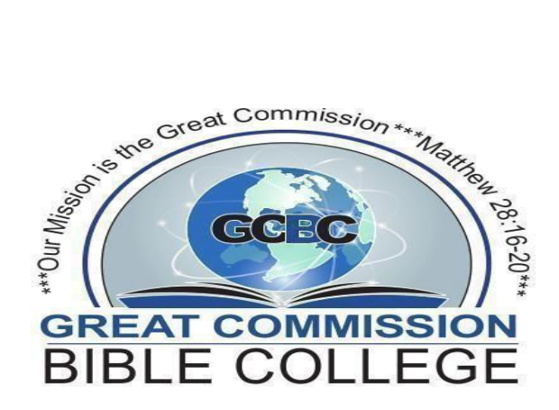
Welcome All Students!

Thank you for enrolling in GCBC! The staff sends a personal welcome to you a n d thanks you for being among the increasing number throughout the world to experience this educational and spiritual opportunity.